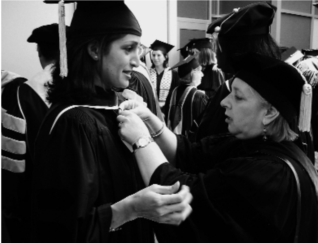
A faculty mentor helps a PhD student adjust her graduation hood. To earn credentials required for many middle-class jobs, students must invest in schooling throughout their 20s or even beyond.