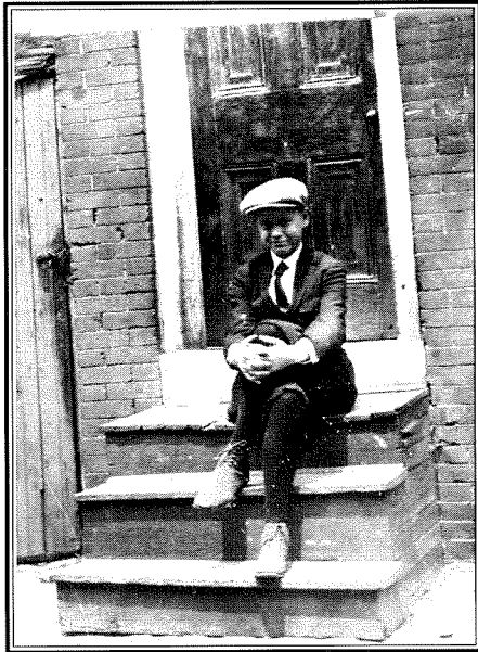
Merton, pictured on the wooden steps of his home in South Philadelphia (c. 1920), was born at what has been described as “the bottom of the social structure.”