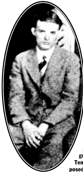
As an undergraduate at Temple, Merton posed with other members of the

Temple gets the credit for birthing the nascent sociologist. He was a philosophy major when, he says, he “ventured into a class in sociology given by a young instruc-